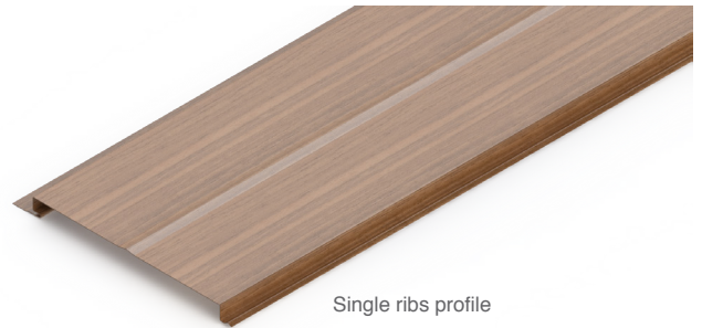
Single ribs profile