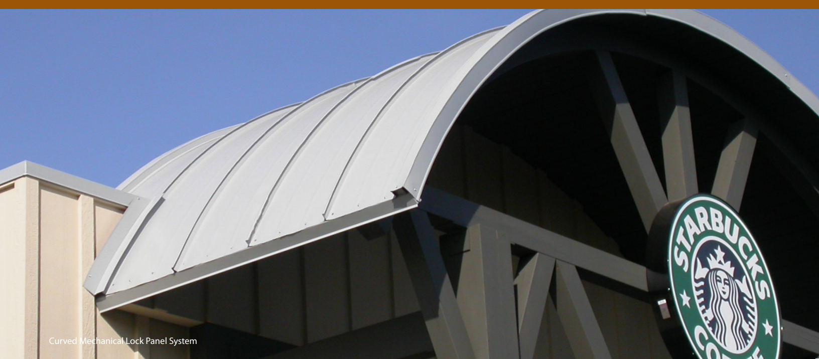
Curved Mechanical Lock Panel System