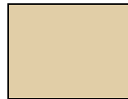
Almond (SRI 78%)