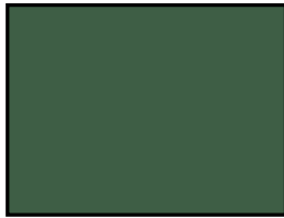
Classic Green (SRI 26%)