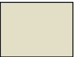
Travertine (SRI 86%)