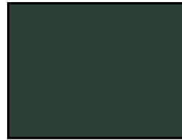
Hartford Green (SRI 25%)