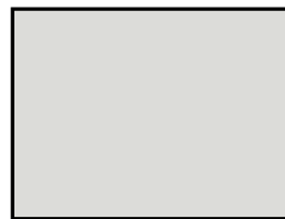
Stone White (SRI 68%)