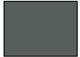
Sage (SRI 30%)