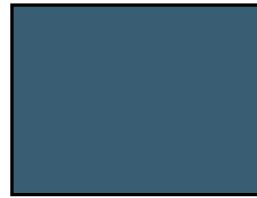
Royal Blue (SRI 25%)