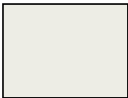
Snowdrift White (SRI 92%)