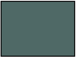
Teal Green (SRI 27%)