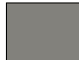
Slate Grey (SRI 37%)