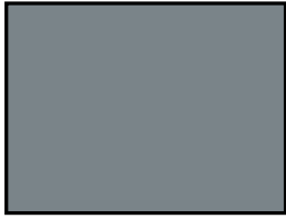
Cape Blue (SRI 44%)